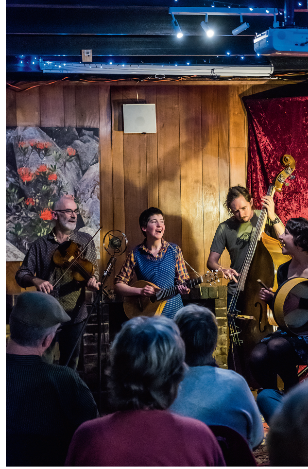
FERN TREE TAVERN

This popular venue in trendy North Hobart features fine local wines, beers and spirits. The menu offers classic café dishes and modern Australian options along with their signature friendly service. Get extra lucky from 3-6pm Tuesday to Saturday with $10 cocktails and $8 tapas plates. They also serve breakfast, lunch and dinner – and their reputation for good coffee is widely known. DON'T MISS: The Buddha bowl and beer deal for $25 on Thursdays. rainchecklounge.com.au